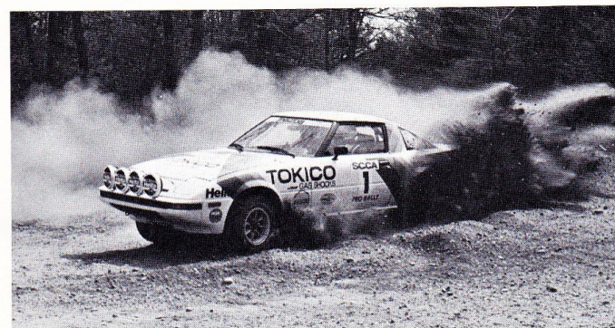
ROD MILLEN - NEW ZEALAND