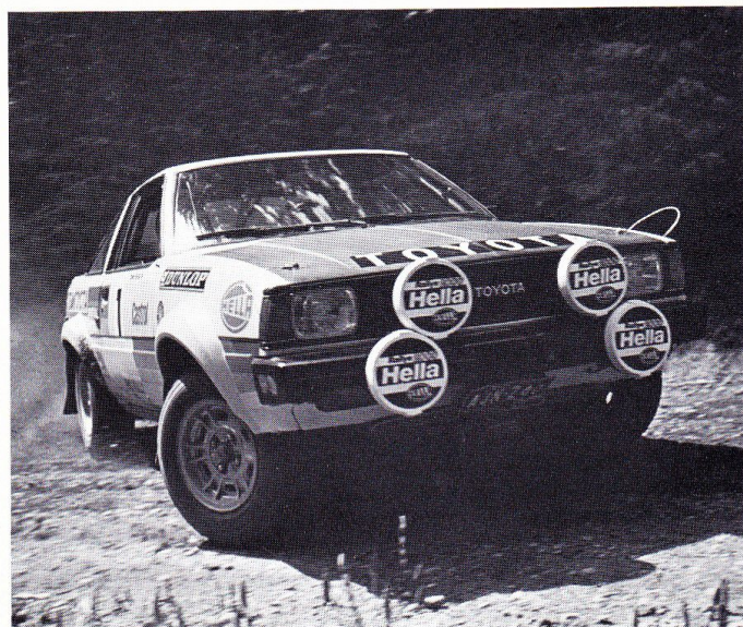
TIASO HEINONEN - CANADA